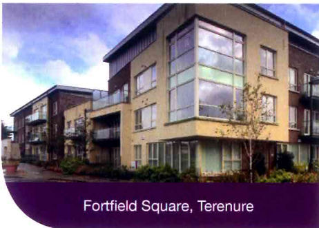
Fortfield Square, Terenure