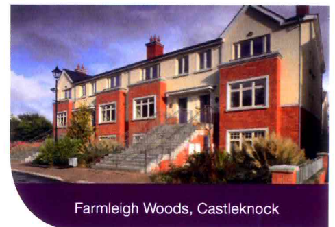
Farmleigh Woods, Castleknock