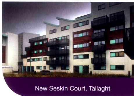
New Seskin Court, Tallaght