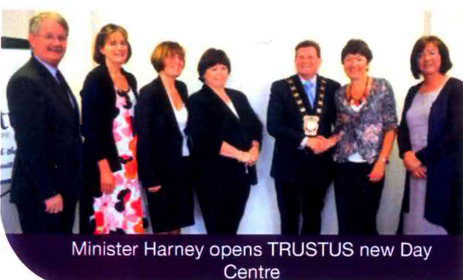
Minister Harney opens TRUSTUS new Day Centre

TRUSTUS celebrated the official opening of its Whitestown Way Day Services Centre. Minister for Health, Mary Harney TD launched the Whitetown Way centre, which is located in Fold Ireland's latest sheltered development in Tallaght.