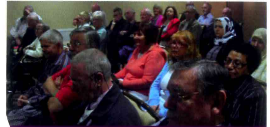
Pre-tenancy meeting at New Seskin Court

With Fold Ireland's latest scheme nearing completion, Fortfield Square in Terenure, Fold will have brought 70 new homes to the Dublin area.