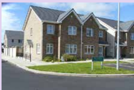
Latchford, Clonee Hansfield, Castaheany, Dublin 15