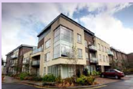
Fortfield Square, Terenure Block 1, The Courtyard, Fortfield Square, College Drive, Terenure, Dublin 6W