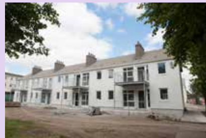
Ballygall Road East Ongar, Dublin 15