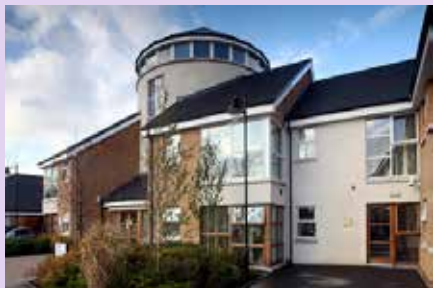
Cherryfields HWC 2D Cherryfields Lawn, Hartstown, Dublin 15