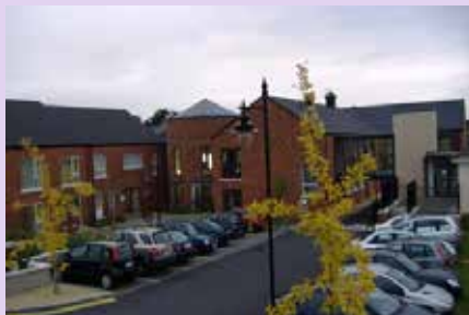
Anam Cara HWC St. Canices Road, Glasnevin, Dublin 11