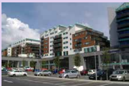
New Seskin Court, Tallaght Block C3, New Seskin Court, Whitestown Way, Tallaght, Dublin 24