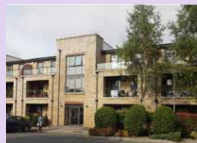
Dunboyne, Co. Meath