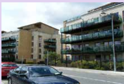
Rathborne Court Rathborne Court, Earlswood, Rathborne, Ashtown, Dublin 15