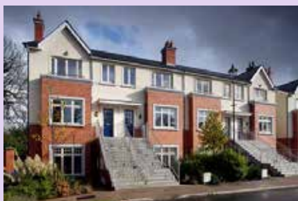
Farmleigh Woods, Castleknock Chestnut Lodge, Farmleigh Woods, Whites Road, Castleknock, Dublin 15