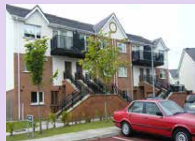
Phibblestown Woods Ongar, Dublin 15